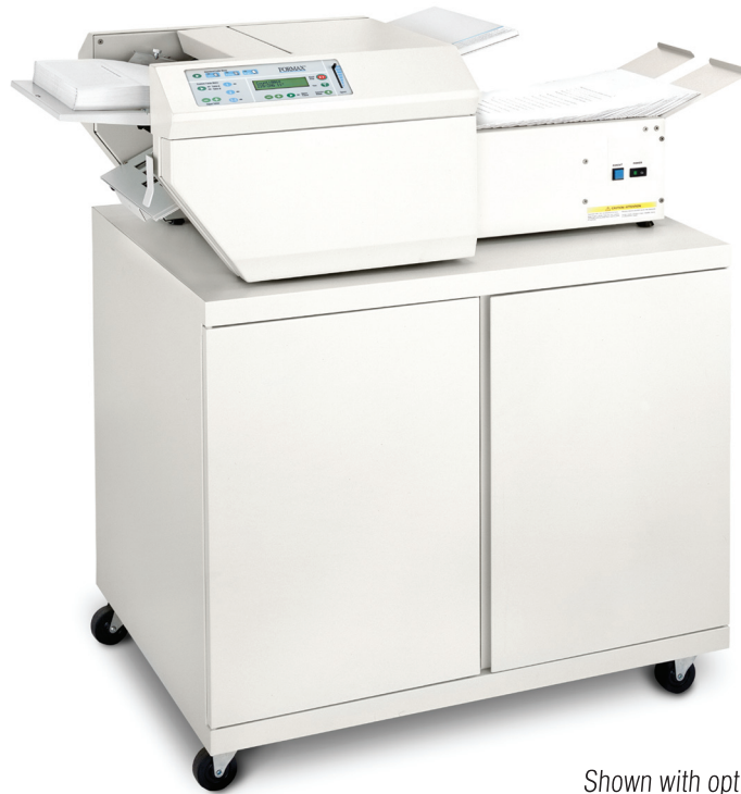
Shown with optional cabinet and 18" conveyor

The AutoSeal® FD 2052 is a fully automatic pressure sealer which provides the ultimate solution for processing pressure sensitive self-mailers. Designed with ease of operation and efficiency in mind, the FD 2052 automatically detects and adjusts for 11" and 14" (Int'l Size A4) paper sizes and is pre-programmed for three popular folds: Z, C and Half folds. The FD 2052 also has the ability to store up to nine custom fold settings with the simple touch of a button.